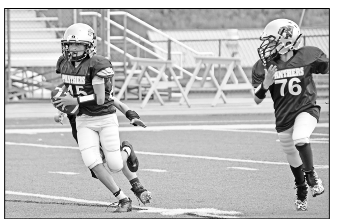
The Union County 10U Panthers during their 24-6 victory over West Hall on Saturday.